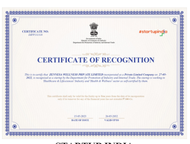
STARTUP INDIA CERTIFICATE